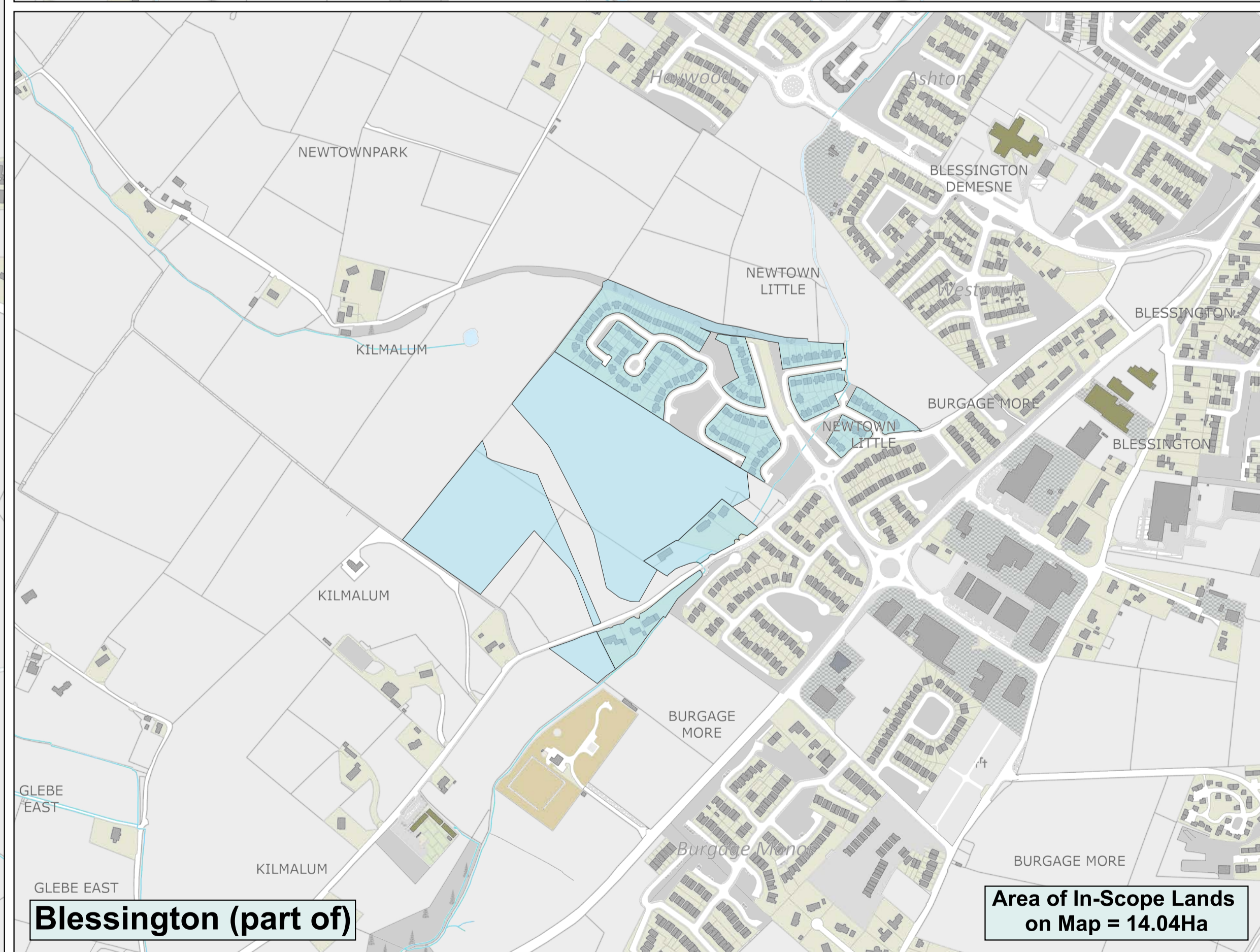
Blessington (part of)